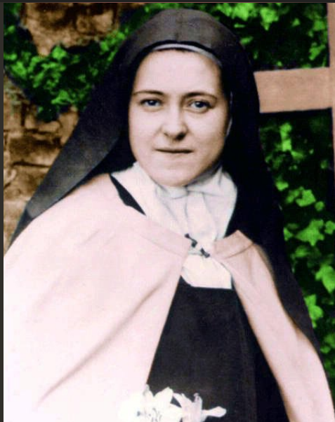
Saint Thérèse of Lisieux Feast Day - October 1