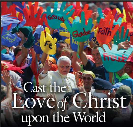
Stand in solidarity with the Holy Father, the faithful worldwide, and those most in need.