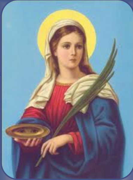
St. Lucy Pray for us!

O Adonai: "O sacred Lord of ancient Israel, who showed yourself to Moses in the burning bush, who gave him the holy law on Sinai mountain: come, stretch out your mighty hand to set us free." Isaiah had prophesied, "But He shall judge the poor with justice, and decide aright for the land's afflicted. He shall strike the ruthless with the rod of his mouth, and with the breath of his lips he shall slay the wicked. Justice shall be the band around his waist, and faithfulness a belt upon his hips." (11:4-5); and "Indeed the Lord will be there with us, majestic; yes the Lord our judge, the Lord our lawgiver, the Lord our king, he it is who will save us." (33:22).