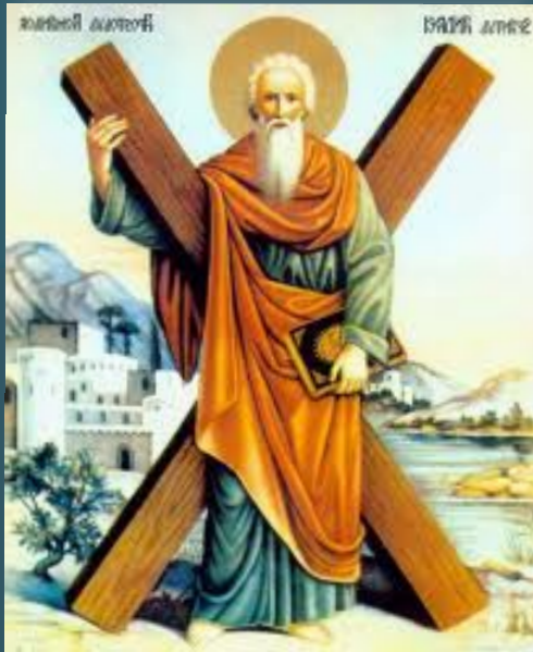
Saint Andrew Pray for us!

Grace and peace from God our Father and the Lord Jesus Christ. I continually thank my God for you because of the favor he has bestowed on you in Christ Jesus, in whom you have been richly endowed with every gift of speech and knowledge.