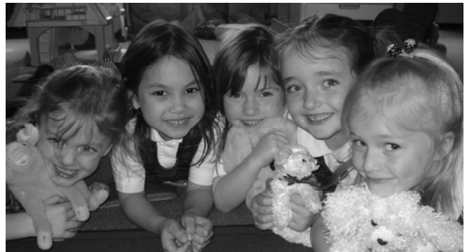
Eight Years of Consistent Growth