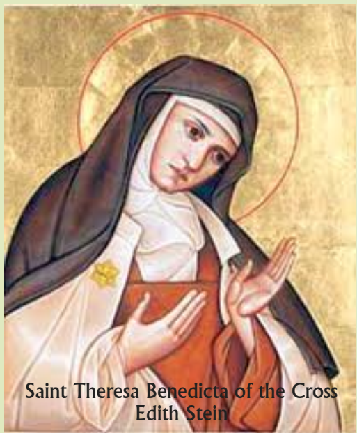
Saint Theresa Benedicta of the Cross Edith Stein

Exult you just, in the Lord, praise from the upright is fitting.